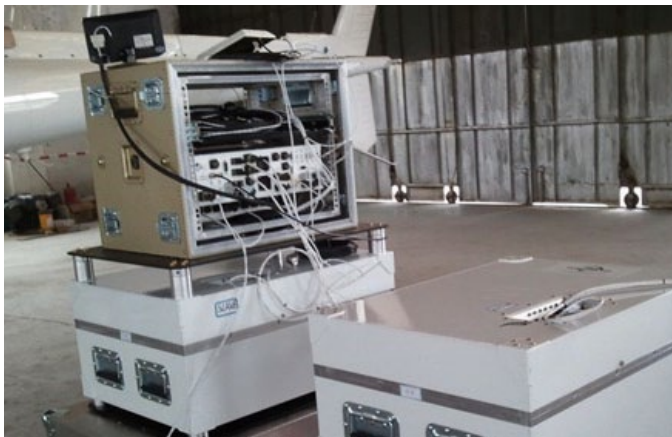
AGRS SYSTEM with 33.6 litres of sensor and equipment rack ready for installation in aircraft

McPHAR's radiometric systems all feature Pico Envirotec's NEW 1024-channels AGRS Advanced Airborne Gamma-ray Spectrometer and sensors. AGRS is a highly advanced system ideally suited for minerals or environmental applications as the maximum throughput of AGRS can be as high as 250,000 counts per second (cps) per detector. AGRS features automatic HV calibration and linearization based on natural radioactive elements, therefore radioactive sources are NOT required for calibration. As well, AGRS features automatic peak detection and real-time calibration. The full spectrum is recorded at a sample rate of once per second (1024 channels) which permits NASVD processing (using PRAGA-3 software). Typically the data are processed to produce the standard IAEA channels, Total Count, Potassium, Uranium and Thorium. Potassium, equivalent Uranium (eU) and Thorium concentrations are derived, as well, various ratios of these concentrations are computed, which greatly aid in the interpretation of the survey results.