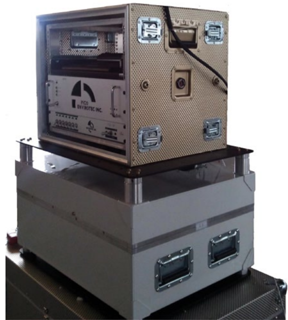
AGRS SYSTEM with 16.8 litres of sensor and equipment rack ready for installation in helicopter

Depending on the application and the airborne platform to be used, the sensor volumes in our AGRS systems range from 16.8 litres of NaI(Tl) detector to 50.4 litres of detector "downward-looking" with an appropriate volume of sensor "upward-looking". A typical helicopter-borne system would have a volume of 16.8 litres "upward-looking" and 4.2 litres "downward-looking", whereas a typical fixed-wing system would have a volume of 33.6 litres "upward-looking" and 8.4 litres "downward-looking".