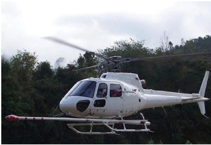
Total-field magnetometer installation in a rigid-boom on an EUROCOPTER AS350B2A-STAR HELICOPTER