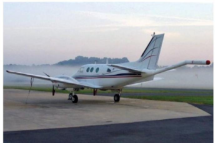
Total-field magnetometer installation in an extended tail-boom on a BEECH C90 KING AIR AIRCRAFT