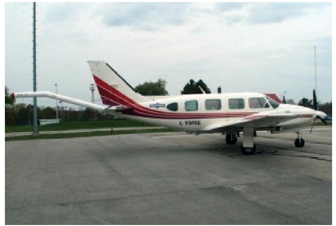
Total-field magnetometer installation in an extended tail-boom on a PIPER PA-31 NAVAJO AIRCRAFT

McPHAR uses several different aircraft to undertake aeromagnetic surveys, in particular the Piper PA-31 Navajo aircraft and the Beech C90 King Air. However, on a project dependent basis we also utilize other aircraft, including the Cessna 206, Cessna 208B Grand Caravan and the Cessna C404 Titan.