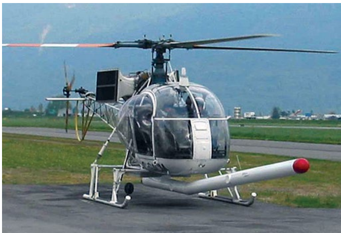
High-resolution magnetometer aerofoil installed on a EUROCOPTER SA315B LAMA HELICOPTER