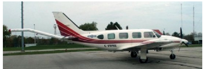
PIPER PA-31 NAVAJO AIRCRAFT in ISMAP configuration.

The benefits of ISMAR are realized by the most modern instrumentation, and the state-of-the-art data acquisition and processing techniques we use, which includes 3-D drape flying, tie-line leveling, micro-leveling, equivalent source corrections where appropriate, and signal enhancement filtering. Aircraft manoeuvre noise during an ISMAR survey, of necessity, is very small. Using the "Figure-of-Merit" (FOM) technique to measure manoeuvre noise, all our aircraft are typically less than 1.0 nT. In addition, the use of differential GPS for navigation and positioning allows micro-magnetic anomalies to be determined to a positional accuracy of about +/- 1 meter.